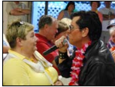
Clockwise: McElvis startled us, caused us to swoon, and just pure entertained us while some just rocked to the music!

7:00 PM Rally Registration and Refreshments