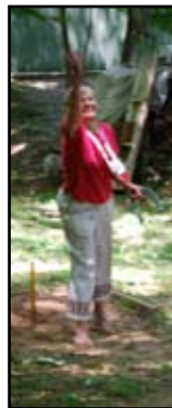
A few of the activities at the last rally included: Top row: fishing, horseshoes, hiking. Bottom row: strawberry picking, Curbside Café, and cooking at the fire pit.