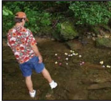
Keeping the racers honest at the 2010 Rubber Duck Race down Andrews Creek!