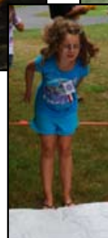
Above: One foot, two feet together—just keep repeating that!