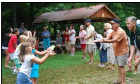
Makes one wonder how many got wet during the adult/child balloon toss.