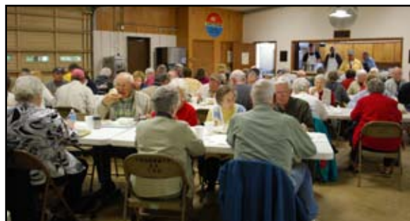
The Bean Supper was well-attended!