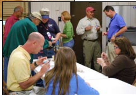
Right: Everyone enjoyed the ice cream.

May brings our Buddy Rally. Please bring prospective Airstream Owners to see what we have to offer. I was asked if there is a limit on the number of Buddies you invite. I'm not aware of any limits in the Park or Unit Rules. This is the only time during the year we can invite friends to see what we do. I hope you will take advantage and bring in future members.