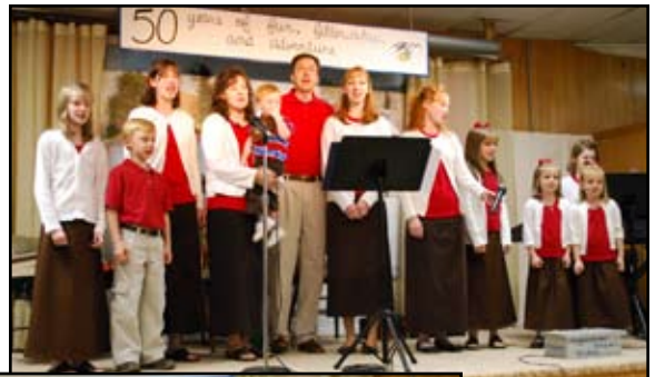
The Neeley Family (all twelve of them)