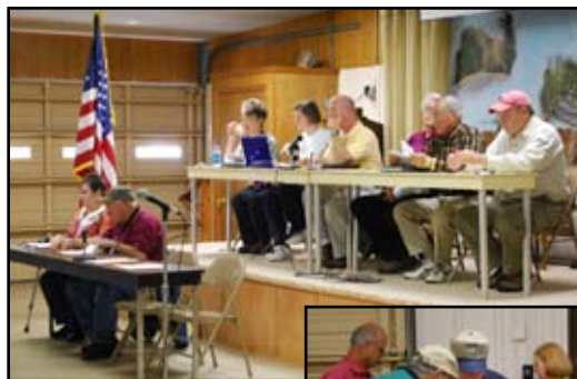
Above: Just before the General Business Meeting.

This was our first try at running a rally. I know we missed a few details, but I hope we didn't miss anything major! Please use the Suggestion Box to offer feedback and new ideas.