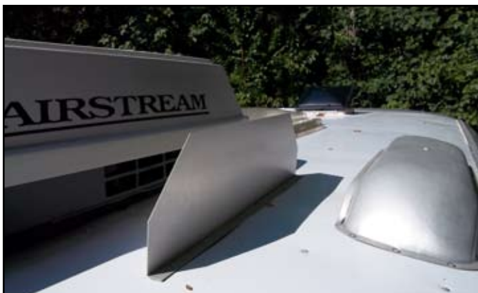
Left to right: air conditioner, baffle, and the refrigerator vent.